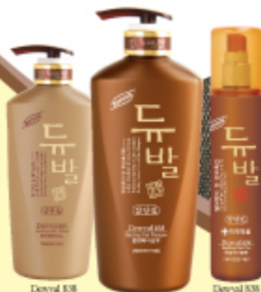
Dewval 838 Hair Conditioner